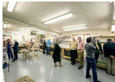
Hand-tool day at Wood Workers Workshop

www.peterseftonfurnitureschool.com www.woodworkersworkshop.co.uk